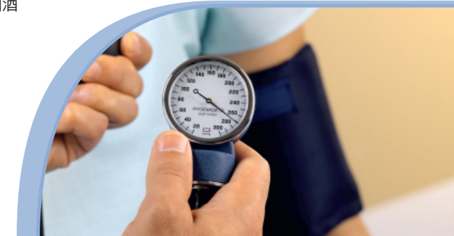
Brain Health Assessment