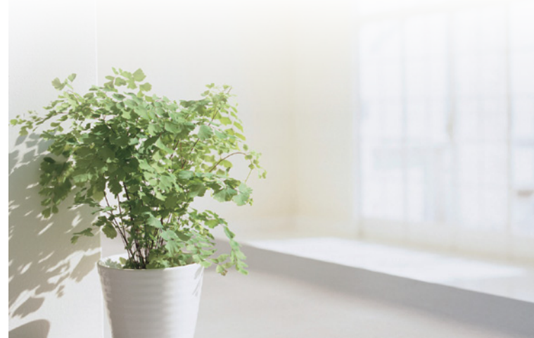
Brain Health Assessment

如家族有中風病史，宜盡早識別本身的中風風險，並作針對性預防，以避免因中風所致的不可逆轉的傷害。