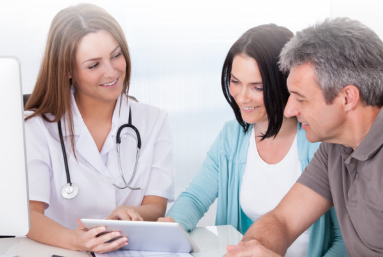
Brain Health Assessment

為協助大眾防範於未然，香港安醫院—司徒拔道提供全面的腦部健康檢查服務，由專科醫生採用先進的醫學科技，為您評估腦部和腦血管的健康狀況。